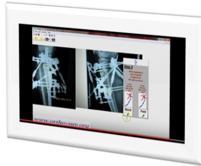
Ortho - Suv 8 e 9