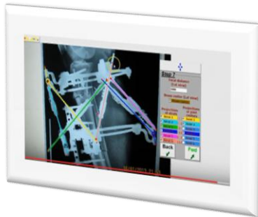
Ortho - Suv 6 e 7