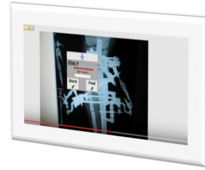
Ortho - Suv 4 e 5