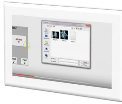
Ortho - Suv 2 e 3